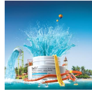
From left: Redeem 1-for-1 Cheese Croissants from Bread Society, Spicy Crabmeat Linguine from The Marmalade Pantry and enjoy a complimentary eight piece skincare kit with purchase of The True Cream - Aqua Bomb at Belif

Singapore, 15 June 2017 – To celebrate Singapore’s love for good food and shopping this Great Singapore Sale (GSS), ION Orchard’s exclusive ION Holidetails is making its return from 9 June – 31 July 2017, after a successful run last year. Besides the on-going 8 th Anniversary rewards from March to 29 October, shoppers can look forward to a wide array of irresistible shopping deals and 1-for-1 dining treats of the best of local and international cuisines on the ION Orchard mobile app that not only promises to be tasty but are also easy on the pocket!